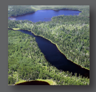
image: Intact forests like this one are increasingly at risk from industrialscale logging.

Greenpeace does not believe that other forest certification systems, such as PEFC (The Programme for the Endorsement of Forest Certification), SFI (Sustainable Forestry Initiative) and MTCS (Malaysian Timber Certification Scheme), can ensure responsible forest management. While the FSC faces challenges, we believe that it contains a framework, as well as principles and criteria, that can guarantee socially and ecologically responsible practices if implemented correctly. The other systems lack robust requirements to protect social and ecological values.