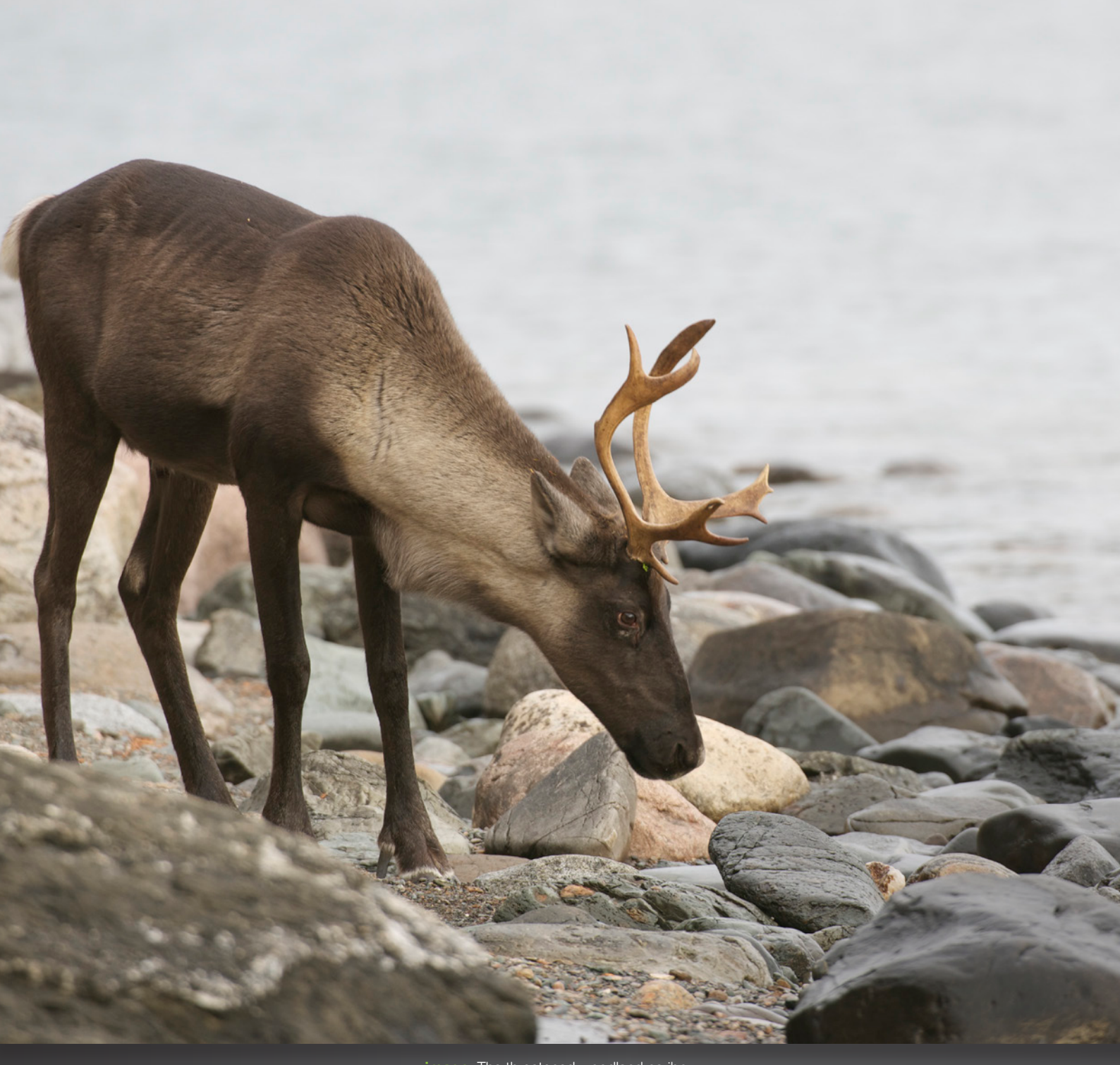
image: The threatened woodland caribou is extremely sensitive to disturbances such as clearcuts and roads